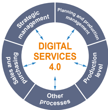
Fig. 1 – Digital services 4.0